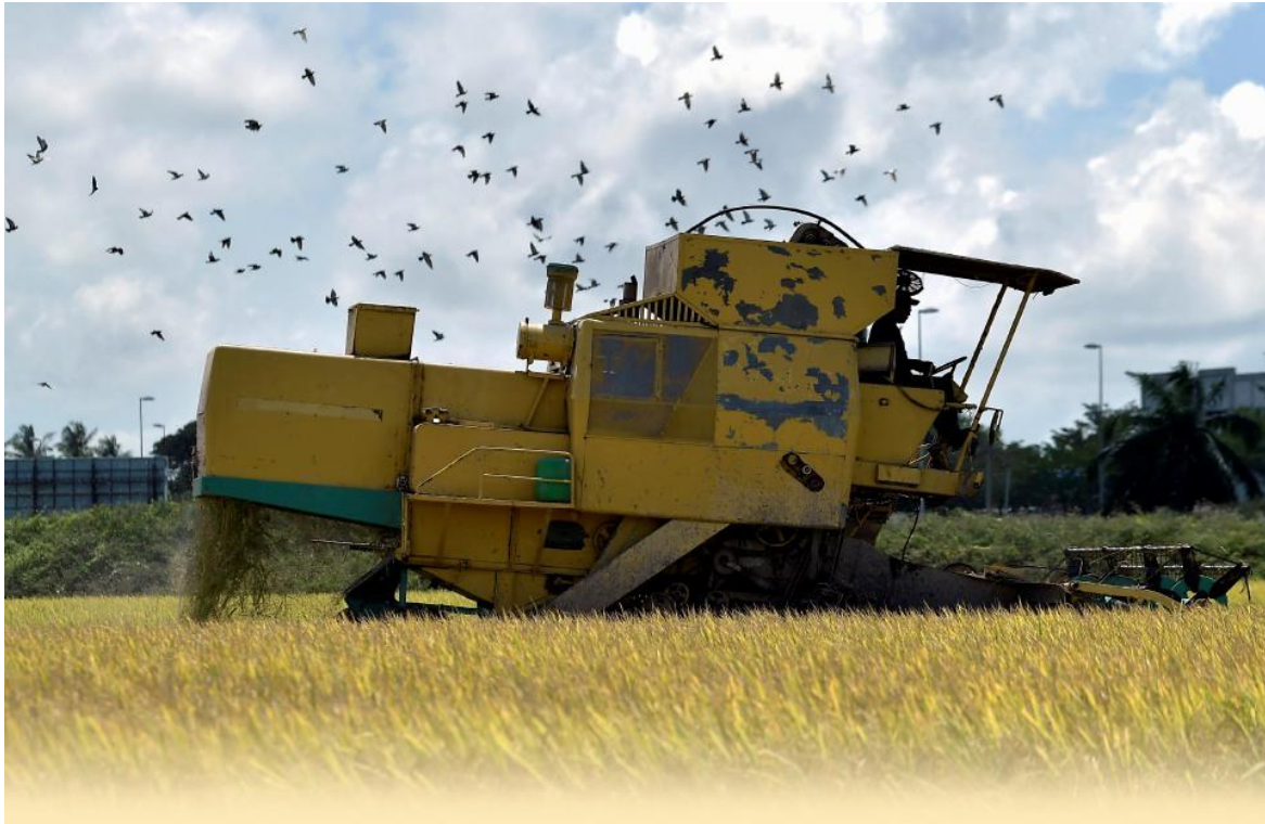
FELCRA, antara agensi KKDW bekerjasama dengan Kerajaan Sarawak dan Sabah membangunkan antara 15,000 hingga 20,000 hektar tanah bagi penanaman padi secara berkelompok dan menyediakan bekalan hampir 300,000 tan setahun.

KUALA LUMPUR: Melepasi setahun pentadbiran Kerajaan Perpaduan pimpinan Perdana Menteri, Datuk Seri Anwar Ibrahim, Kementerian Kemajuan Desa dan Wilayah (KKDW) antara yang banyak menggerakkan usaha ke arah meningkatkan taraf hidup masyarakat di lokaliti sasaran.